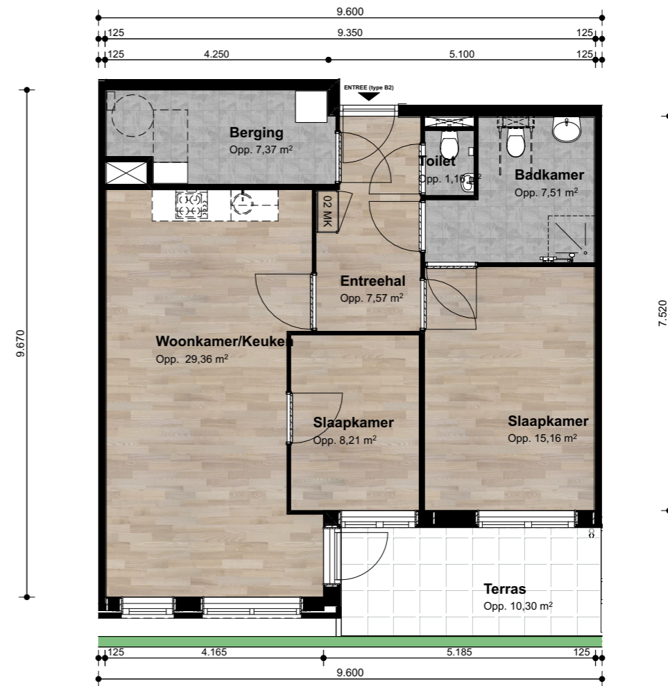
Type B2 BGG Aantal: 7 st. GO: 78,74 m 2