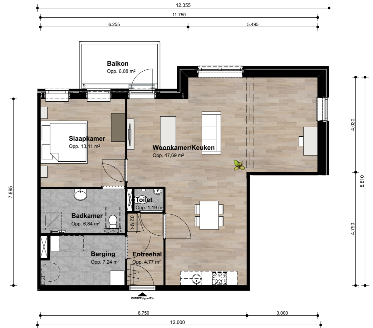
Type B3 Aantal: 6 st. GO: 83,42 m 2