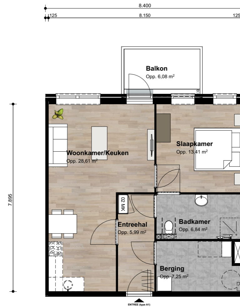
Type A1 Aantal: 15 st. GO: 64,34 m 2